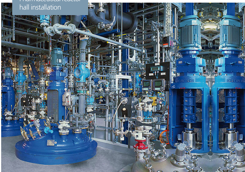
Pharmaceutical reactor hall installation

Currently in the development stage, this is being carried out through a partnership with a KTP programme with the North West Regional College. This sees a graduate come to work