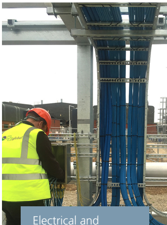
Electrical and instrumentation installation