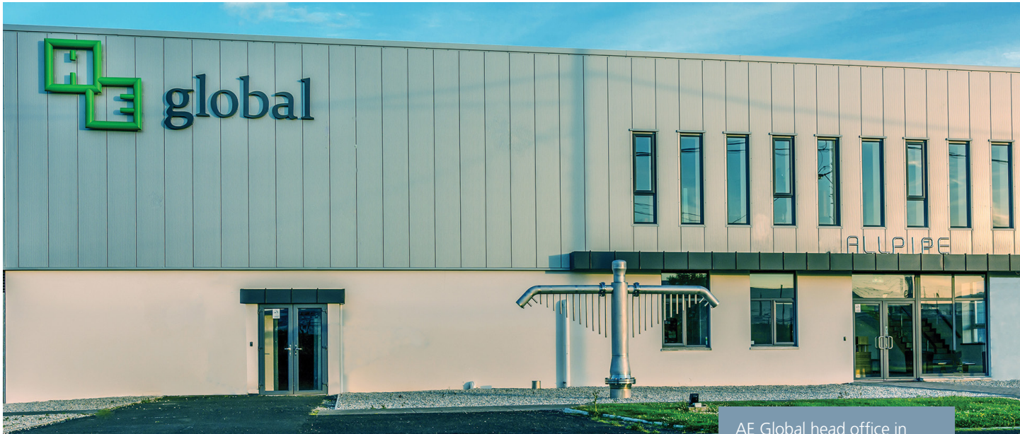
AE Global head office in Northern Ireland